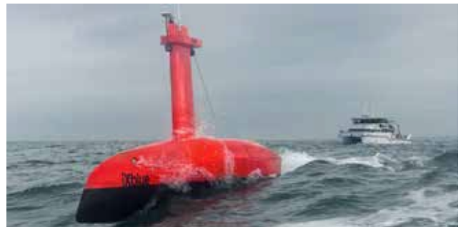
NOAA's Office of Coast Survey and the University of New Hampshire's Center for Coastal and Ocean Mapping/Joint Hydrographic Center are working with iXblue to evaluate the "DriX" USV as a force multiplier by working in tandem with research ships to increase rates of ocean-bottom mapping.

Partnerships with industry to research and develop the design and use of UxS is a key provision in CENOTE and can be expanded through multiple mechanisms. These include CRADAs, increased use of NOPP, Small Business Innovation Research grants, contracts, cross-agency agreements, and other vehicles as appropriate to increase and accelerate collaborations, support commercialization, assist with assessments of commercially available UxS, and participate in cooperative investigations. Iterative demonstrations and field trials of industry technologies, and evaluation of acquisition alternatives, e.g. government owned/operated, industry owned/operated, leasing, and data or product buys have proven successful and important. Through these collaborations, NOAA will also grow advocacy and awareness of UxS mission priorities.