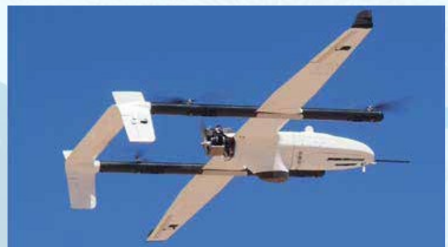
The L3 Latitude is a hybrid quadrotor UAS that combines vertical takeoff and landing with the speed and range of a fixed-wing aircraft. NOAA is testing it for launching from a ship for climate and air quality studies, fishery and mammal surveys, weather observations, oil spill detection, and post severe weather damage assessments.

To ensure the NOAA Uncrewed Systems Strategy realizes transformational advances in performance, skill, and efficiency, NOAA is developing a companion UxS Strategic Implementation Plan or "Roadmap" that will define detailed action items, deadlines, and responsibilities scaled to potential available funding levels. Meanwhile, NOAA's use of uncrewed systems is already significantly improving performance in our lifesaving and economically impactful missions, and setting the course to strengthen our renowned environmental science and technology leadership for the coming decades. Together with our advances in NOAA's other science and technology focus areas—AI, 'Omics, and Cloud Computing—NOAA will achieve our top agency priorities to regain global leadership in numerical weather prediction and sustainably expand the American Blue Economy.