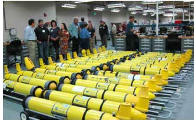
NOAA's U.S. Integrated Ocean Observing System Program partnered with the U.S. Navy and Shell Oil Co. to share data from over 20 gliders deployed in the Gulf of Mexico in 2018. Salinity and temperature data from gliders can improve hurricane intensity forecasts.

Formal concepts of operations (CONOPS) describing UxS operational applications to NOAA mission priorities will ensure efficient and reproducible operational methods, including flexibility to adapt and align to potentially radically different approaches like working beyond line-of-sight or operating swarms of platforms. CONOPS may also describe allocation pools to share UxS assets similar to provisioning of NOAA ships and aircraft to help ensure the greatest number and highest priority of mission requirements are satisfied. Integrating these diverse operational modes into an overall NOAA UxS CONOPS will improve consistency of operations, and provide a template for partner organizations. The CONOPS will include language that states NOAA will operate UxS assets in a safe and secure manner in compliance with all relevant environmental laws, ensuring that operations do not interfere with individual privacy rights or adversely