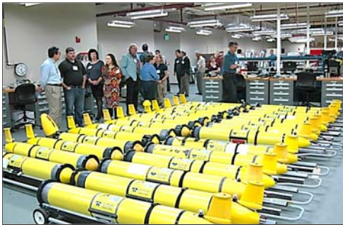
NOAA's U.S. Integrated Ocean Observing System Program partnered with the U.S. Navy and Shell Oil Co. to share data from over 20 gliders deployed in the Gulf of Mexico in 2018. Salinity and temperature data from gliders can improve hurricane intensity forecasts.

Promoting the expanded and innovative use of UxS across the full scope of NOAA's earth science missions will expand the community-of-practice where UxS operators and data users connect across the agency on common ways to develop, acquire, test, configure, manage, and utilize new systems. This could include developing the requisite companion policies, procedures, and regulations to support field operations, and possibly requiring funded partners to track progress in the use and applications of UxS performed or supported annually.