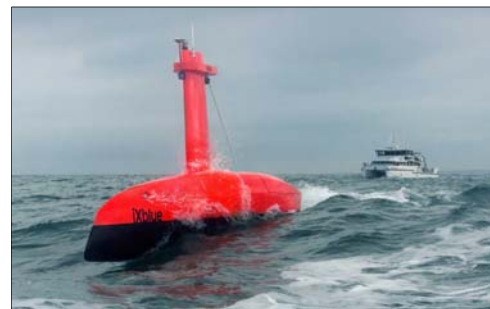
NOAA's Office of Coast Survey and the University of New Hampshire's Center for Coastal and Ocean Mapping/Joint Hydrographic Center are working with iXblue to evaluate the "DriX" USV as a force multiplier by working in tandem with research ships to increase rates of ocean bottom mapping.

Cooperative partnerships serve as force multipliers to optimize resources and effort, and the resulting scientific and technological exchange keeps NOAA current in the rapidly evolving field of UxS. Current collaborations on UxS applications have already created a community-of-practice at NOAA that is sparking innovation and has the opportunity to