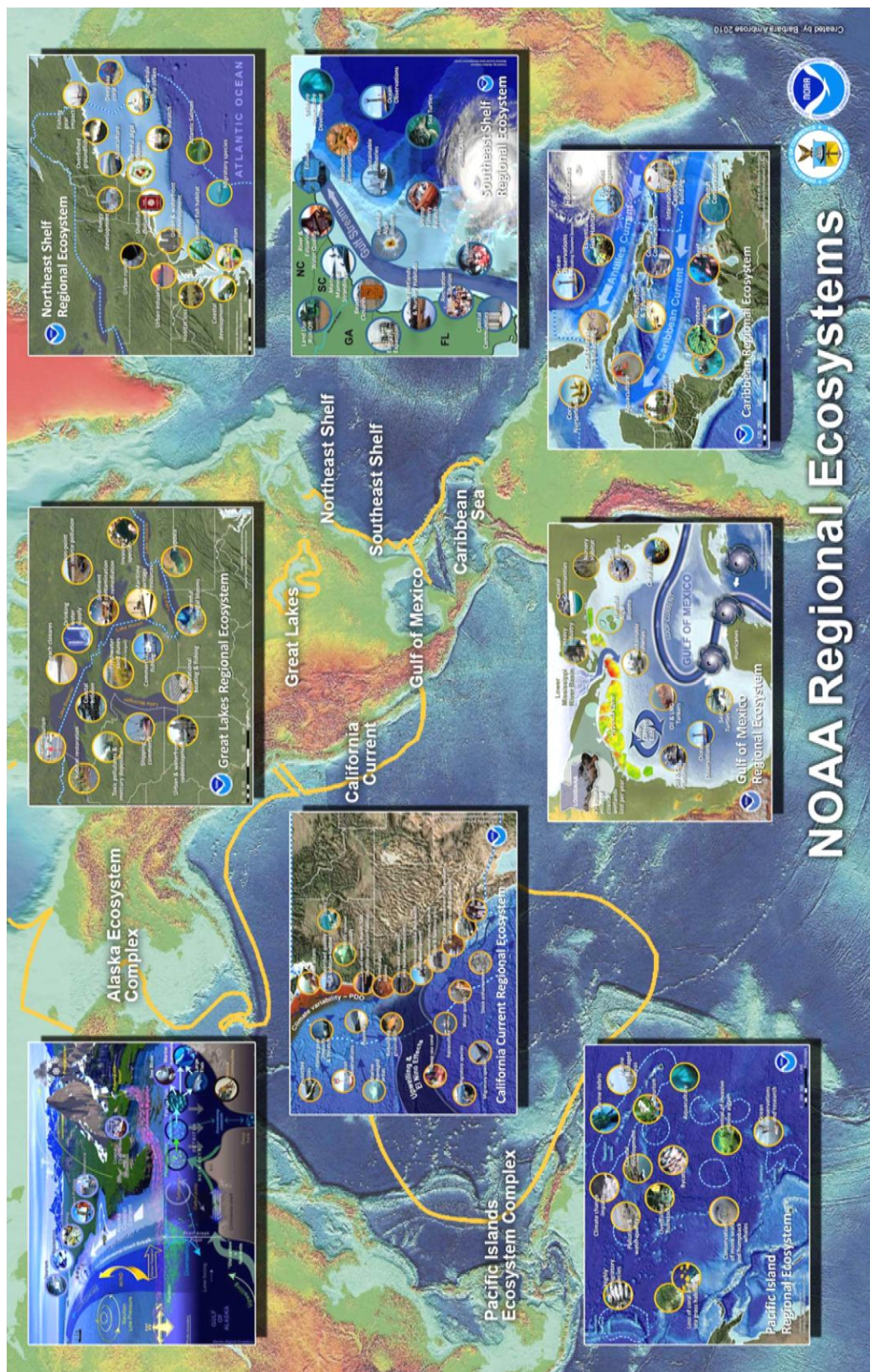
Figure 2: NOAA's Regional Ecosystems