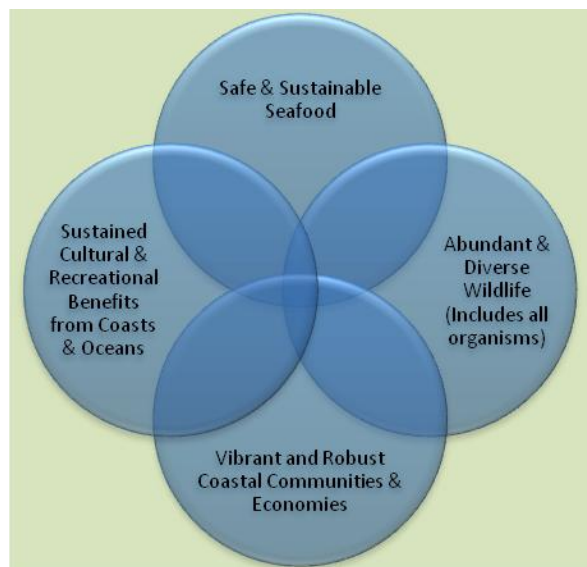
FIGURE 1: ECOSYSTEM RESEARCH THEMES

To this end, the workshop was designed to encourage workshop participants to provide input about how NOAA could take an integrative and holistic approach to ecosystem research. Participants were drawn from across NOAA’s Line Offices, other Federal agencies, academic institutions, and NGOs. They represented NOAA’s diverse