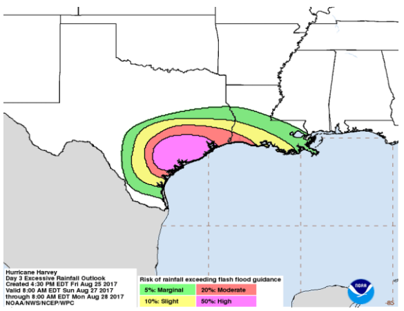
Figure 1. The risk of rainfall exceeding flash flood guidance expresses the uncertainty both probabilistically and categorically during Hurricane Harvev

other extreme events. Values and categories (e.g. 20% moderate) indicate a range of uncertainty (Figure 1). While all of these methods deliver value to decision makers, they can fall short. Capturing the probability of an event does not always provide the specific information most critical to a decision maker. For instance, citrus growers see impacts at specific temperatures. Highway maintenance crews care most about specific temperatures, snowfall amounts and timing. Others, such as emergency managers or residents may best use a combination of probabilities and thresholds to prepare for the specific impacts of tropical storms, such as wind (Figure 2) or storm surge, and other severe weather events. Accordingly, NOAA continues to develop and communicate probabilistic information to provide a spectrum of possibilities that allows users to assess their risk using their respective criteria and thresholds.