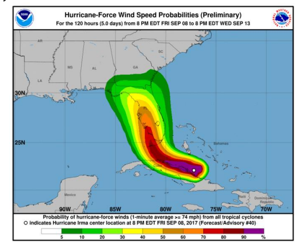
Figure 2. Range of probability of hurricane force surface winds during Hurricane Irma indicating the range of uncertainty