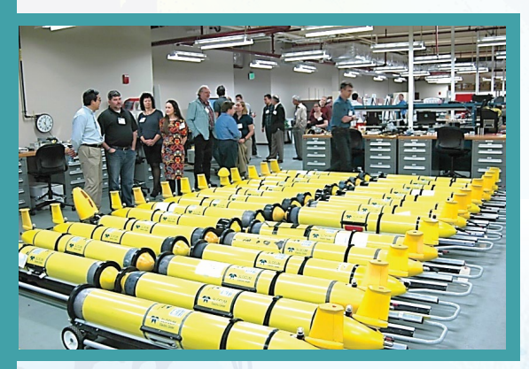
NOAA's Integrated Ocean Observing System partnered with the U.S. Navy and Shell Oil Co. to share data from over 20 gliders deployed in the Gulf of Mexico in 2018. Salinity and temperature data from gliders can improve hurricane intensity forecasts.