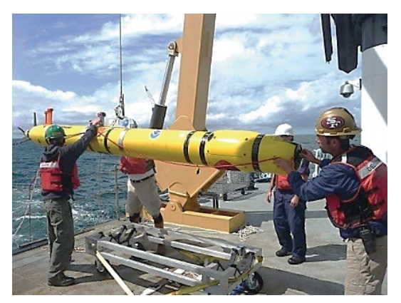
NOAA's Office of Coast Survey prepares to launch a Hydroid REMUS 600 autonomous underwater vehicle on a bathymetric mapping mission. This vehicle can operate for 20+ hours at depths up to 450 meters while maintaining acoustic communications with the host ship.