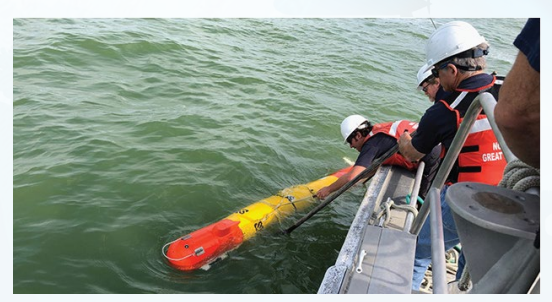
For the third year in a row, NOAA is using Environmental Sample Processors designed by the Monterey Bay Aquarium Research Institute and mounted on a UUV to study potentially toxic algal blooms in Lake Erie in collaboration with NOAA's Great Lakes Environmental Research Laboratory.

To ensure the NDAA Uncrewed Systems Strategy realizes transformational advances in performance, skill, and efficiency, NDAA is developing a UxS Strategic Implementation Plan or "Roadmap" to define detailed action items, deadlines, and responsibilities. Meanwhile, NDAA's use of UxS is already improving performance in our lifesaving and economically impactful missions, and setting the course to strengthen our renowned environmental science and technology leadership for the coming decades. Through this, NDAA will achieve our top agency priorities to regain and maintain global leadership in numerical weather prediction and sustainably expand the American Blue Economy.