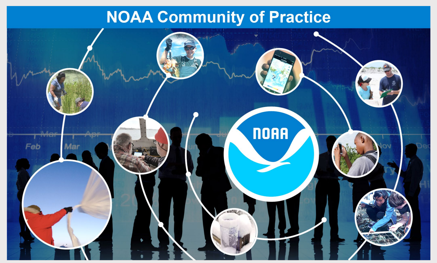
We work collaboratively across NOAA.

The NOAA Citizen Science Community of Practice connects and supports citizen science work across the agency. It was launched by the Office of Education in 2013. Its formation and structure were informed by the NOAA Education Council and NOAA citizen science project leads. The community relies on voluntary grassroots participation and works to compile best practices, share resources, and maintain a searchable database of projects. It is open to anyone within NOAA working to, or interested in, engaging the public in the scientific process through citizen science. In April of 2020, the Community of Practice organized and participated in the first NOAA Citizen Science Workshop. As of 2022, the Community of Practice had over 225 members and primarily communicates via an email listserv.