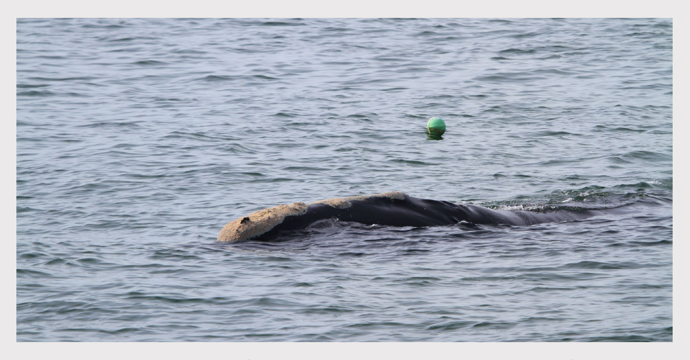
North Atlantic right whale swims next to blue crab fishing gear marked with a green buoy.

Using novel solutions to address our challenges will offer NOAA Fisheries the opportunity to solve tough, mission-critical problems by engaging innovative collaborations to achieve a common goal. One such project aims to identify technology options to track the location of ropeless/buoyless fishing gear. There is a great need for ropeless/buoyless fishing gear to reduce the amount of vertical lines in the water column, which pose serious and lethal threats to marine mammals and sea turtles. The threat of entanglement from vertical fishing lines is particularly severe for North Atlantic right whales and leatherback sea turtles, which are endangered species. Tracking technology on ropeless/buoyless fishing gear would allow fishers to relocate their gear without the need for a surface buoy and its associated lines. A collaborative team of NOAA scientists and Yet2, an innovative technology scouting firm, worked to identify robust technology options to track ropeless/buoyless fishing gear deployments. This capability will allow gear locations to be shared with fishermen, as well as enforcement agencies and nearby vessels. This new technology initiative is an important contribution toward NOAA Fisheries' mission in the stewardship of living marine resources, because it would mitigate one of the primary threats to endangered whales and sea turtles, entanglement in fishing gear.