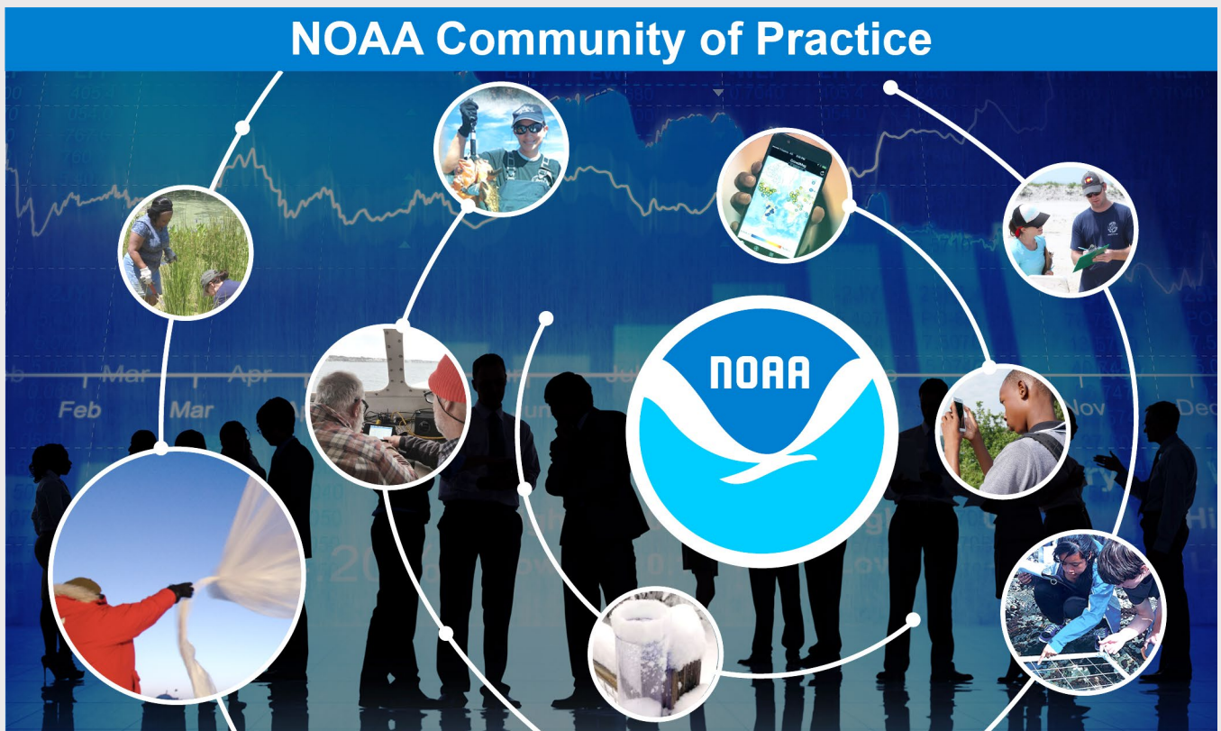
We work collaboratively across NOAA.

The NOAA Citizen Science Community of Practice connects and supports citizen science work across the agency. It was launched by the Office of Education in 2013. Its formation and structure were informed by the NOAA Education Council and NOAA citizen science project leads. The community relies on voluntary grassroots participation and works to compile best practices, share resources, and maintain a searchable database of projects. It is open to anyone within NOAA working to, or interested in, engaging the public in the scientific process through citizen science. In April of 2020, the Community of Practice organized and participated in the first NOAA Citizen Science Workshop. As of 2022, the Community of Practice had over 225 members and primarily communicates via an email listserv.