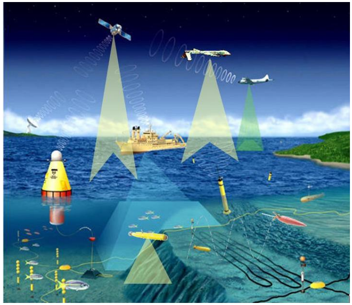
Comprehensive Earth Observing System. Autonomous and remotely piloted in situ platforms complement standard ship, aircraft, satellite, and tethered platforms.

and evaluating the use of UAS to improve our understanding of hurricanes, marine ecosystems, polar regions, wildfires, and to gather in situ observations in environments that would be hazardous to human aircrews. NOAA is performing UAS operations to expand marine mammal and turtle abundance surveys, and limited operations to gather atmospheric chemical samples and assess severe storm damage.