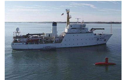
NOAA Ship Thomas Jefferson underway with the DriX unmanned surface vehicle.

increase the productivity of fishery acoustic and ocean mapping surveys compared to ships alone.